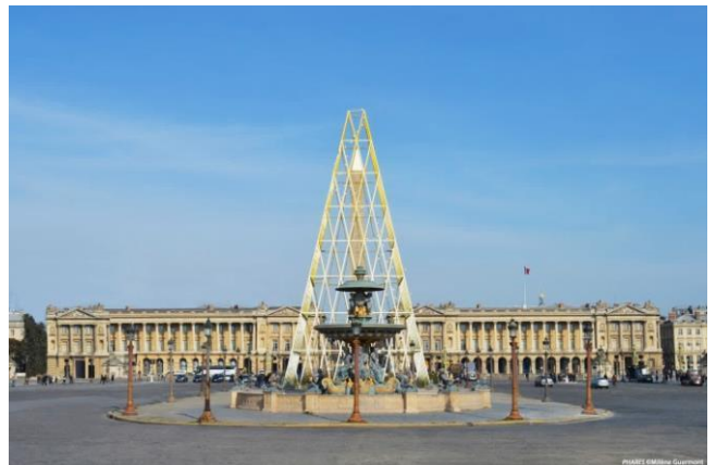
PHARES on Place de la Concorde by night & by day