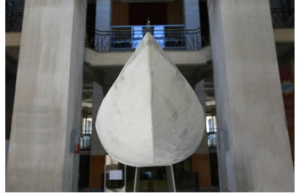
INSTANTS, CAUSSE, AGUA, ADM © Milène Guermont / ADAGP