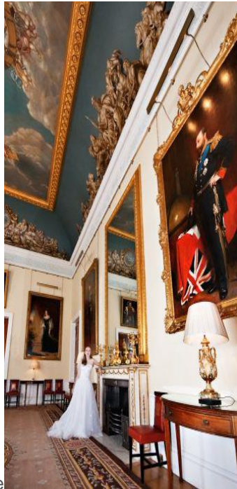
The Unique History of Trinity House

Music - The Mobile Music Company offers wedding event clients booked via the Trinity House an exclusive offer comprising £295.00 plus VAT for the 'compact space' version with modified lighting and sound systems for smaller spaces or £375.00 plus VAT for a DJ, PA system and full-effect disco lighting...PLUS a choice of free disco mirror ball with spotlights or free room up lighting or a free recording of the music played at the wedding burned onto a CD for posterity.